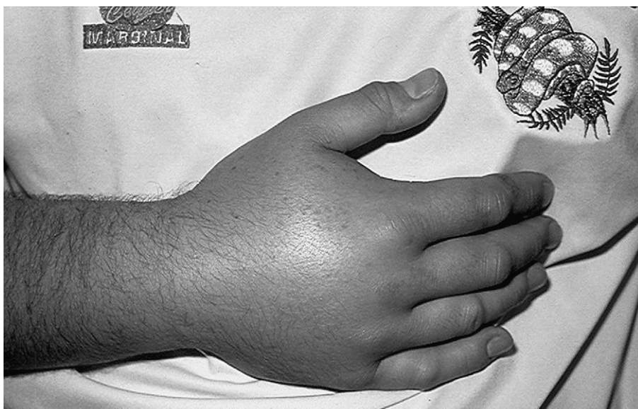
Fig. 3. Edema caused by a Philodryas patagoniensis bite a few hours after the accident. Tourniquet was not used.

Peichoto et al. (2006) showed that when this venom was administered i.v. it induced histopathological modifications